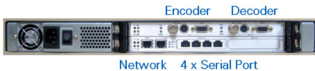
PIRANHA 1020 Standard Analog Configuration

The PIRANHA is available in two chassis formats. The PIRANHA 1020 is a 1RU single encoder system. The PIRANHA 1060 is a 3RU platform configurable with up to 5 encoders. In both systems each PIRANHA encoder card is as well equipped with an output port that can be used for baseband signal loop through or as a decoder for local stream validation or even for remote stream monitoring. Two PIRANHA encoder “blade” formats are available; and analog blade supporting composite and s-video and a digital blade supporting composite and SDI (closed caption data on SDI pending development).